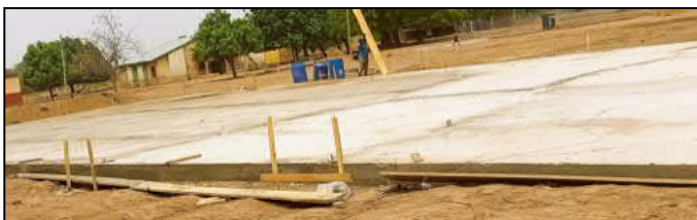
The completed foundation!

We also need help funding cement blocks, windows, doors, electrical work, chairs and desks. If you would like to help us in funding the building, the best way is to send a check to Tech Serve and note Yamah Orphanage in the memo section. If you prefer online you can go to Tech Serve's website and click on Donate, and specify—Yamah Orphanage in your submission. Everything you give will go to the new school for orphans, even the smallest donations will help!