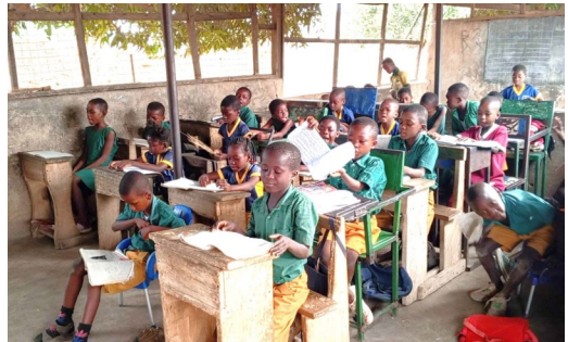
OLD SCHOOL BUILDING