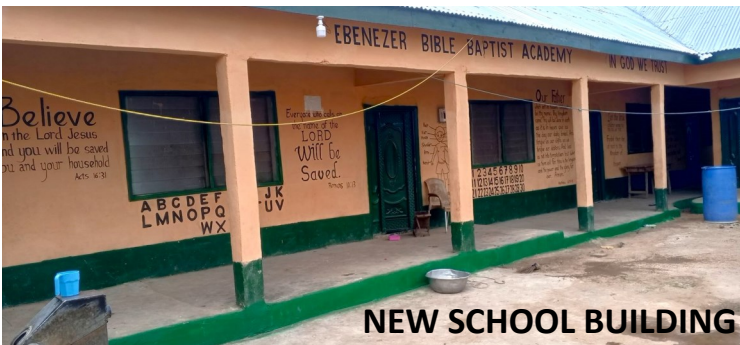
NEW SCHOOL BUILDING

in one location adds 6 new classrooms and 2 offices. This additional space allowed enrollment to go from just over 100 students to over 130 students. Pastor EB and his staff are teaching the children to make room for Jesus in their lives.