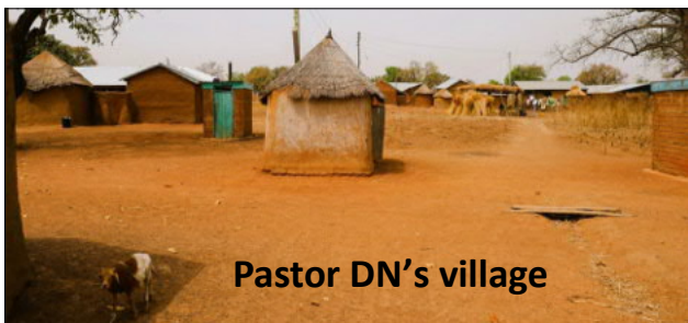
Pastor DN's village

Today, in a remote village in Africa, you can connect to the Free Wi-Fi signal, and end up at a simple webpage with icons. These icons give access to specific categories that open up to more categories and to more videos. Here you will find thousands of videos instructing everything from kindergarten math, to basic geometry, to lessons on physics and basic chemistry. There are thousands of Bible story videos for children, movies like the Jesus Film, and even an icon for the local church, where you will find videos and audio messages from the Pastor who is hosting the Wi-Fi system.