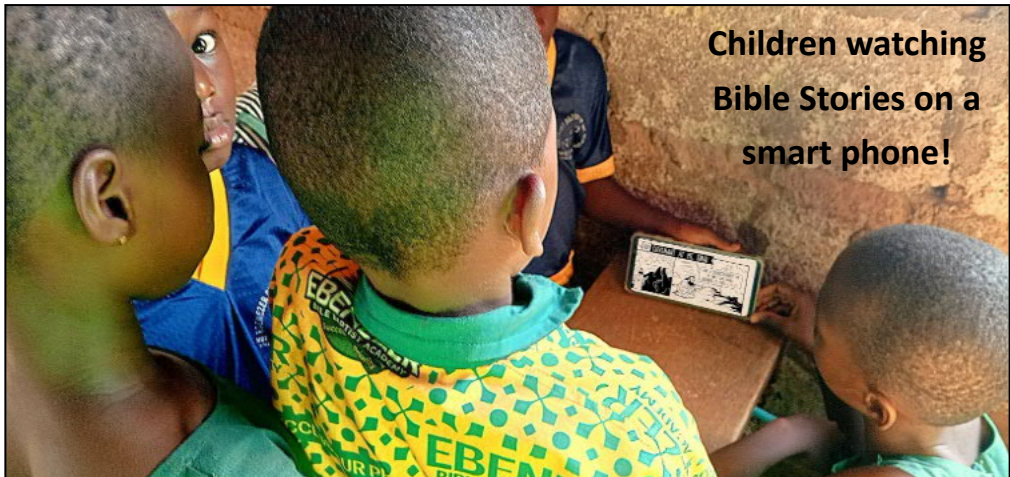
Children watching Bible Stories on a smart phone!