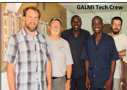
GALMI Tech Crew