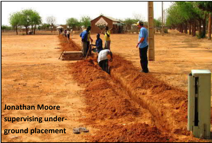
Jonathan Moore supervising underground placement

set up and networking was available for the Doctors. 1000 feet of underground cable was installed to connect 20 telephones throughout the facility. Network and internet was also piped back to the doctors quarters 1/2 mile away. There another wireless access point and