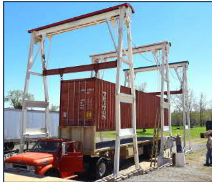
Gantry in Action!