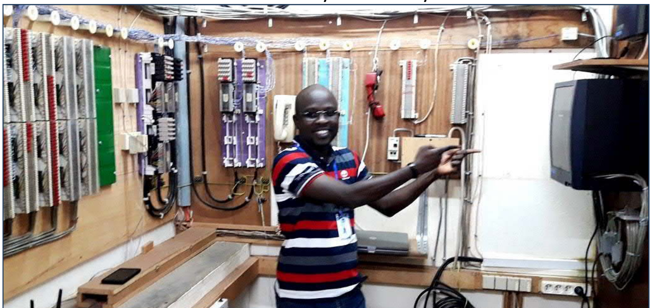
Technician with newly installed system!