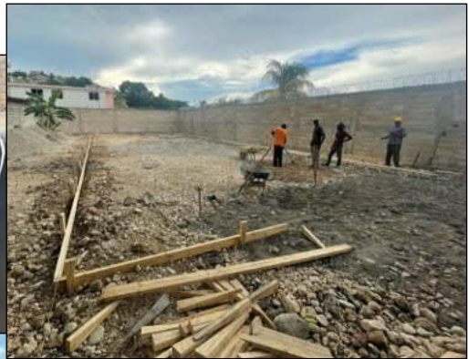
Hand mixed Cement!